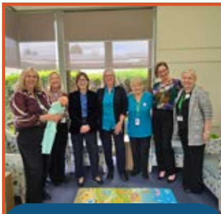
Minister visited our EPU and acknowledged their service