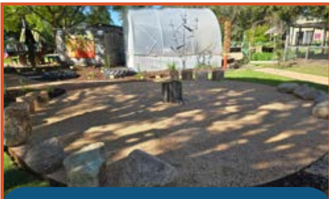
Koo Wee Rup Aboriginal Meeting Place & Bush School

The event also included the unveiling of our Acknowledgment of Country Plaque, which stands as a reminder that KRHS is a place where everyone is warmly welcomed and where the Indigenous community can feel culturally safe and respected.