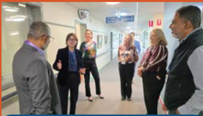
Health Minister met with our Executive Team

The Minister said, "As someone who represents a regional electorate, I deeply understand the unique strengths and challenges of small country towns. KRHS exemplifies the kind of connected, compassionate care that makes a real difference in people's lives."